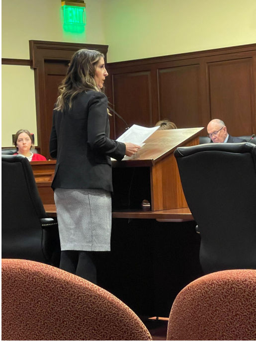
Senator Lori Den Hartog testified before the Senate Transportation Committee.